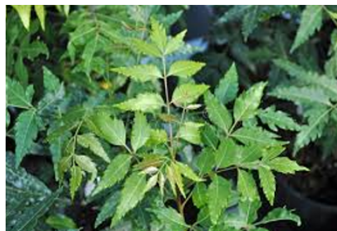
Fig. 2: The neem leaflet

Imparipinnate 20-37 cm in length. Leaf-lets are opposite or alternate, obliquely falcate-lanceolate, serrate, dark green to greenish yellow in colour. 2