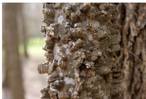
Fig. 5: The neem bark

Neem oil is expressed from seeds and it contains chiefly glycerides of oleic (50%) and stearic (20%) acids. 6