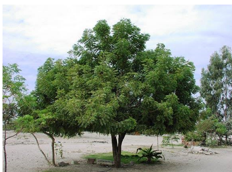
Fig. 1: The neem tree

It is typically grown in tropical and semi-tropical regions. Neem trees also grow in islands located in the southern part of Iran. Its fruits and seeds are the source of neem oil. 1