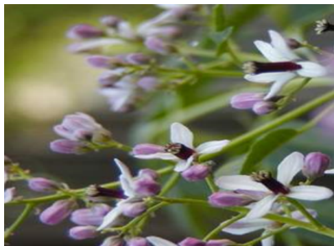
Fig. 3: The neem flowers

White scented 5 mm long pentamers, staminal tube, dentate, anthers inserted inside. 3