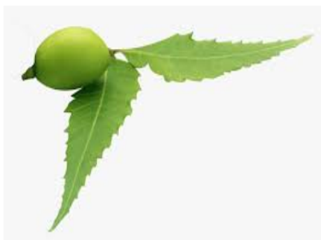
Fig. 4: The neem drupe

Drupe 1.2 to 1.8 cm long, oblong, 1 — seeded smooth greenish yellow in colour. Intensely bitter in Taste. 4