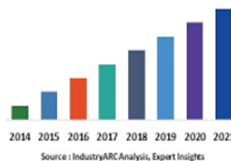
Fig. 4: Market of gene therapy from 2014-2021