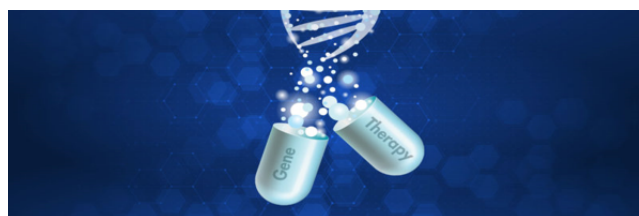
Fig. 1: Imaginary representation of future gene therapy

For the treatment of genetic disease of disorder gene therapy is preferably used and also DNA is introduced into a patient body. For the correction of disease causing mutation the new DNA commonly contain a functioning gene. 1 For the treatment of prevention of disease the section of DNA gene therapy is mostly used. The DNA