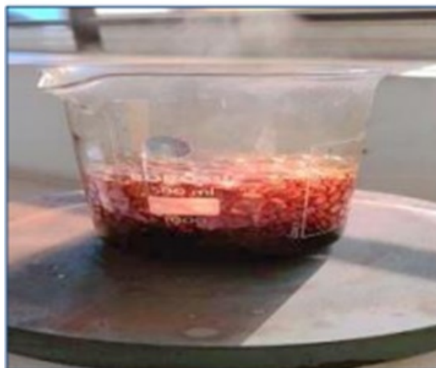
Figure 2: Concentrated tamarind pulp