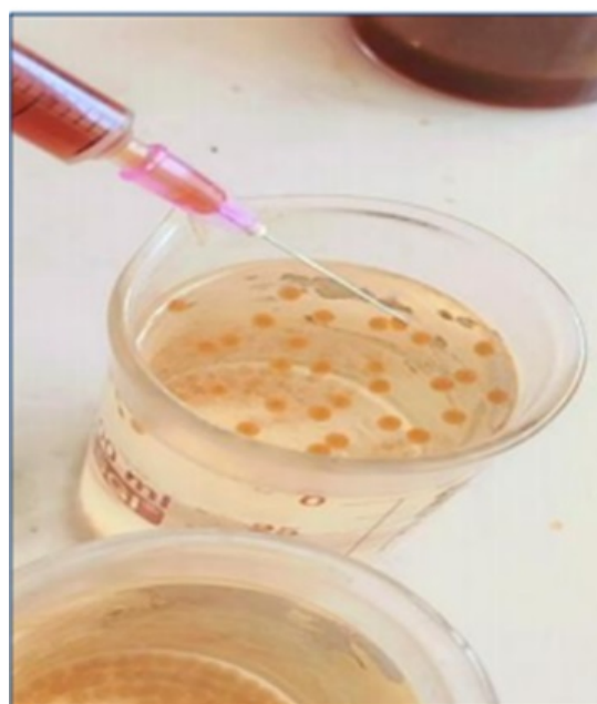
Figure 3: Tamarind microspheres