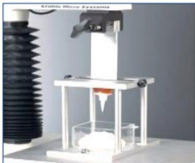
Figure 7: Extrudability test