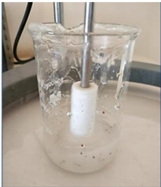
Figure 5: Tamarind microspheres gel